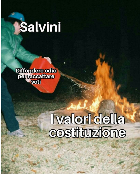
Figure 2: Two examples from the dataset for Hate Speech Identification: the meme at the top is classified as hate speech content, whereas the meme at the bottom is not.

for Task A and Task B considering only the positive class. For what concerns Task C, which is a multiclass classification task, we computed the performance for each class and then calculated the macro-average over all classes.