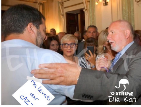
Salvini: "Quando ho lasciato il mio ufficio al Viminale, ho visto delle lacrime"