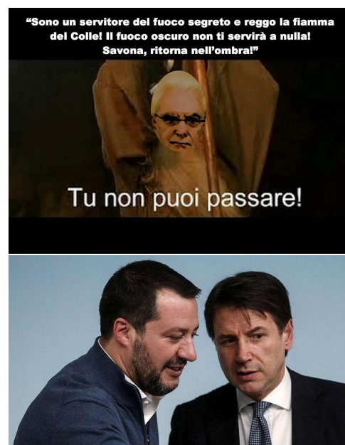
Figure 1: Two examples from the dataset for Meme Detection: the image at the top is a meme, whereas the image at the bottom is not a meme.

The initial dataset was split into three datasets, one for each task, structured as follows: